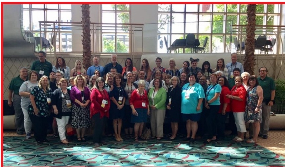
A group of dedicated Autism Society volunteers and staff from across the nation gathered in Milwaukee in July, 2017.

The Autism Society envisions a world where individuals and families living with autism are able to maximize their quality of life, are treated with the highest level of dignity, and live in a society in which their talents and skills are appreciated and valued.