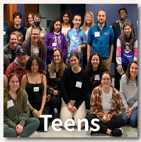
4 Programs / 10 Events