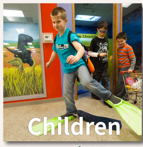
5 Programs / 30 Events