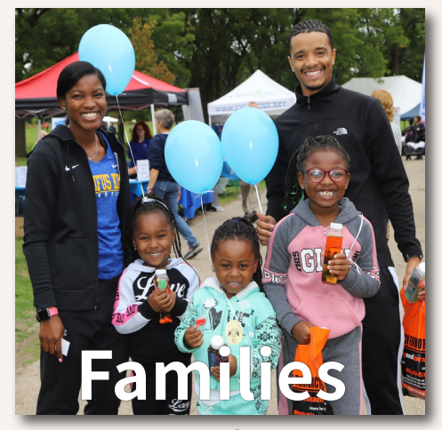
7 Programs / 13 Events

We continue to strive to improve the quality of life of everyone affected by Autism. With the new 2023 diagnostic rate of 1 in 36, we must continue to accommodate the pressing need for support and programs for people on the Spectrum, their families, and the community across the lifespan. Together , we can make a difference in our community.